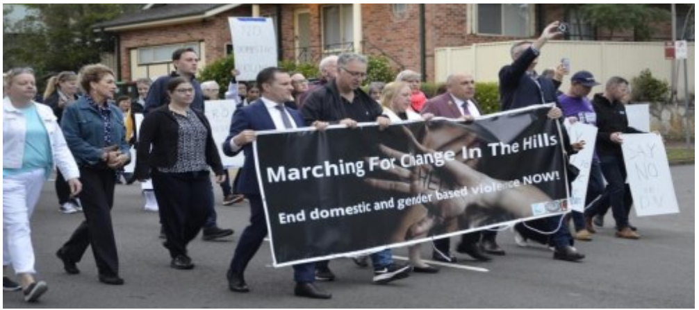
Bottom of Page 6 and Page 7 photos taken last Friday in the Community march against Domestic Violence.